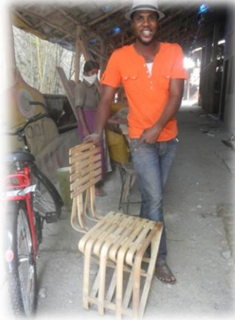
Bamboo Lampshade and Chair made by the students