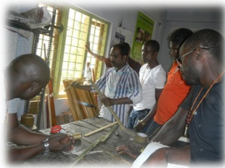
Learning techniques of Bamboo bending