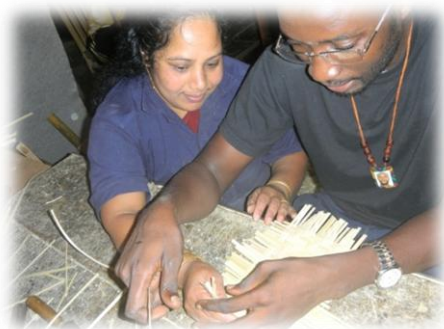
Learning to weave bamboo