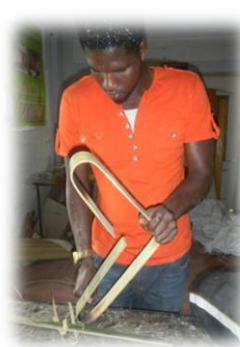
Making of bamboo shirt hanger