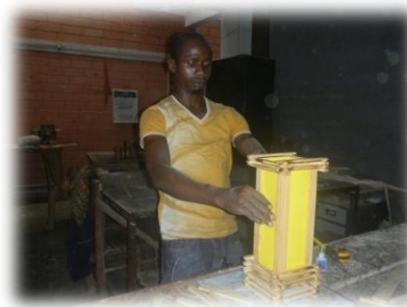
Making Bamboo lampshade