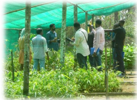
Training in Bamboo Nursery