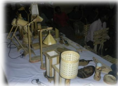
Students display their products during graduation