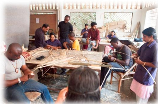
Training in workshop

In January this year, the local government partnered with Springboard to train five ex-political violent youth on bamboo craftsmanship in India. This was carried out to create meaningful and responsible jobs for them and put an end to the crime these youth have long engaged with. Also, this will help to add value to several species of bamboo wasting away in the community. Over 1000 functional and decorative products can be generated from bamboo. In the coming weeks, the local government will be working with us to raise funds towards establishing a bamboo cluster where these youth will make their bamboo products and also train others in bamboo craftsmanship. During the 5 weeks training, students learnt to make bamboo- chair, pen, bed, lampshade, solar torch, masks, key chain, etc. The pictures below show some training activities and products made.