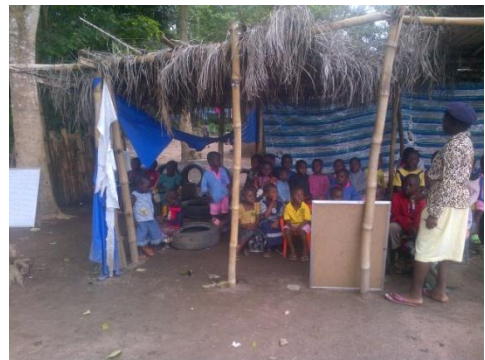
Community School for farmers' children