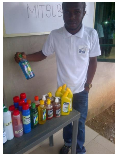
Liquid soap making

In December 2016, we shall do a special Newsletter chronicling some Springboard Community Entrepreneurs and their enterprises.