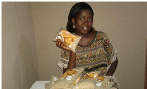
Local Rice Packaging