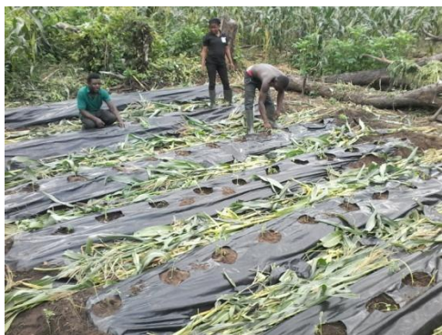
Tomato & pepper farm