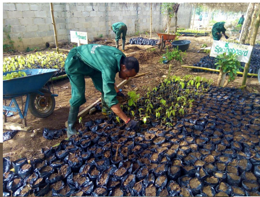
Student Farmers doing group work in the class and on the Farm.