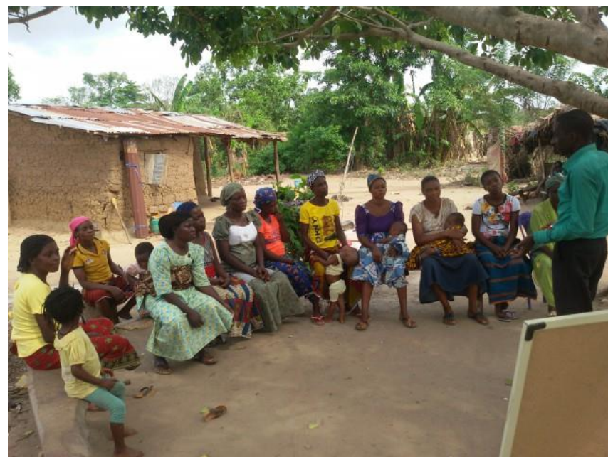
Training sessions at the Rural Women Entrepreneurship program