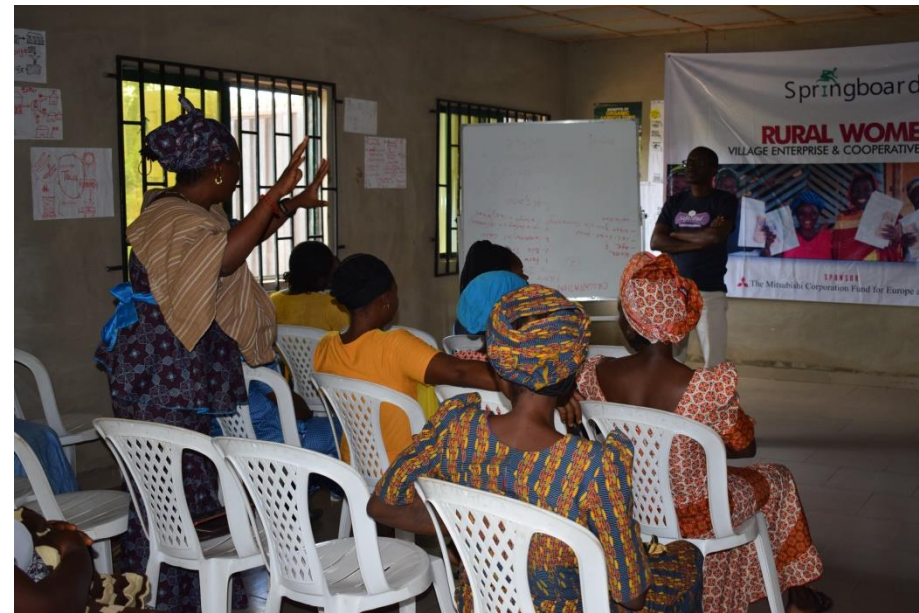
Participants from Imafon village receiving their training at the Springboard building.