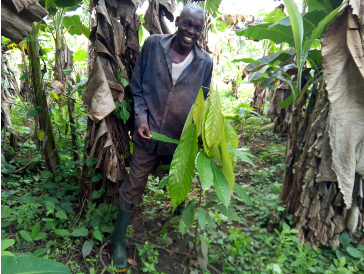
Springboard staff posing with a cocoa tree on the Springboard Demo farm

We planted over 3000 cocoa seedlings on the Springboard Demo Farm during the Planting season. We also sold over 10,000 cocoa seedlings to our farmers. These Seedlings are sprouting beautifully!!!