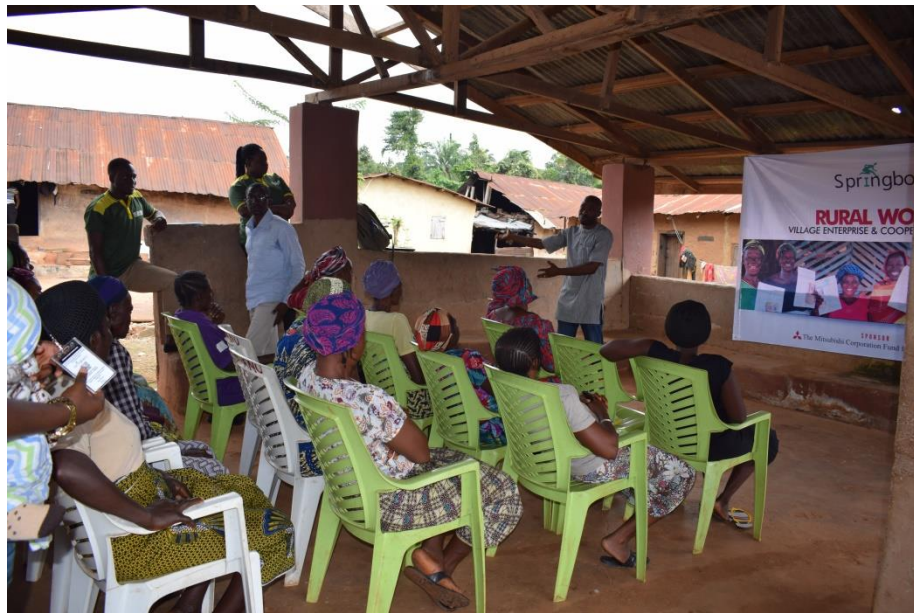
Trainees at Onipanu village

With support from the Mitsubishi Corporation Fund for Europe and Africa, we are expanding on our rural women Cooperative Program. During the 3 rd quarter, another batch of 100 rural women were selected from 10 communities and currently undergoing training in Village Enterprise start up and will receive micro credit to start their small businesses at the end of the training.