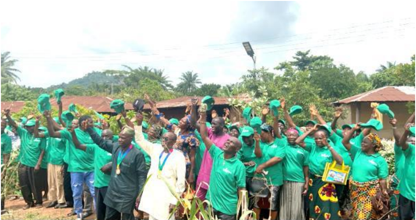
Photo: Springboard Farmers at the 2024 Annual General Meeting

www.springboardnig.com office@springboardnig.com www.facebook.com/springboardnetwork