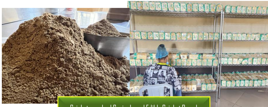
Cricket powder | Springboard Edible Cricket Bread

Springboard is committed to tackling malnutrition in rural communities and urban centers through our affordable and nutritious products, including edible cricket bread, plantain chips and chocolate. We produce healthy foods that deliver essential nutrients to Nigerians. Our mission is to ensure that individuals and families, especially vulnerable groups such as rural dwellers and children, have access to nutritious options. In doing so, we also aim to create hundreds of meaningful jobs for rural women and youth.