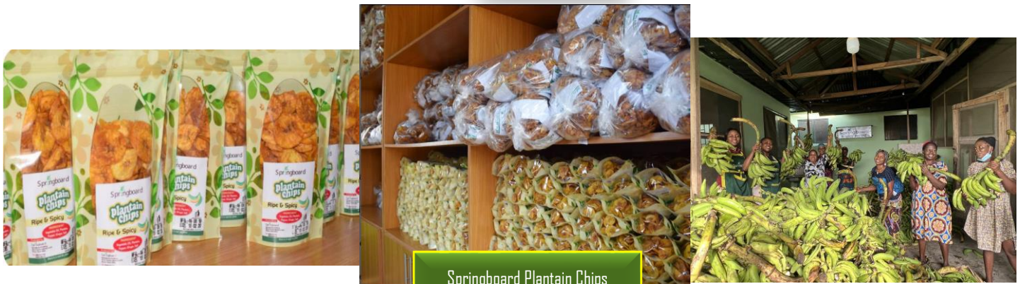
Springboard Plantain Chips